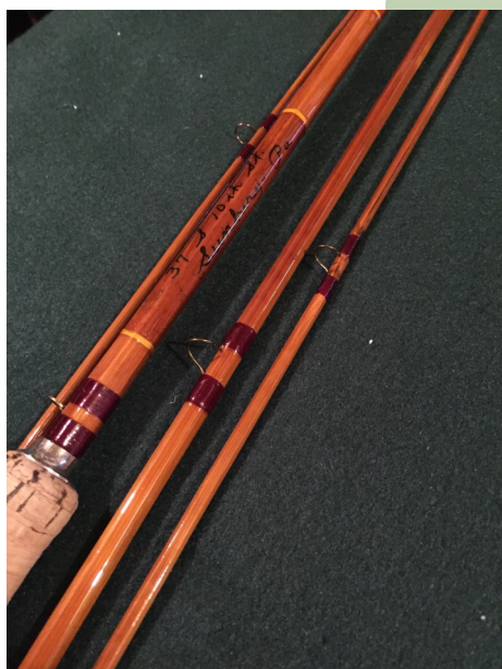
His father's refinished bamboo rod (above) and the author (right) with a smallie from Penns Creek.