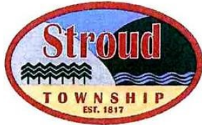
Stroud Township Brodhead Creek Park