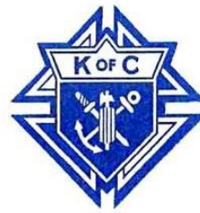
Father John T. Butler Council No. 4084