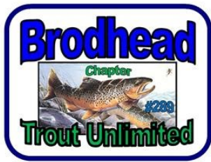
Brodhead Chapter of Trout Unlimited