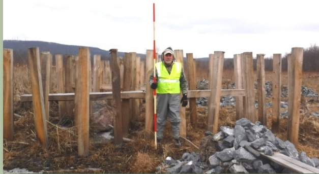
Pole Cluster with horizontal members Minsi Lake