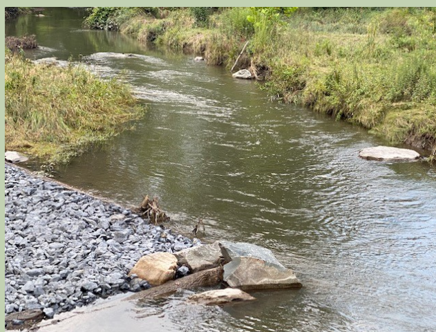
(Immediate Left. A log-framed diverter positioned above the lower footbridge narrows the channel as boulder placements upstream provide some needed cover.)