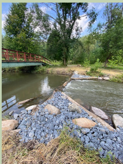
(Left. A log-throated cross-vane situated downstream of the lower foot bridge.)

Although we couldn't get together to help them, the US Fish and Wildlife staff completed our planned improvements on Cherry Creek during the month of August. The photos below show the new devices that were installed. We have new log-throated cross-vanes (2), a new log-framed diverter, a new single-log diverter, new stone cross-vanes (2) and random boulder placements. Most of these were installed before the floods and were intact after the waters receded. Good news! Now, with some cooler temperatures and, hopefully, some fall rains, the trout will move about and discover the new habitat and stay put. Reports are that trout were caught off the two new log-throated cross vanes. Success. Many thanks to Mike Horn, Jared Green and the rest of the crew from USFWS for making this happen. Great job!