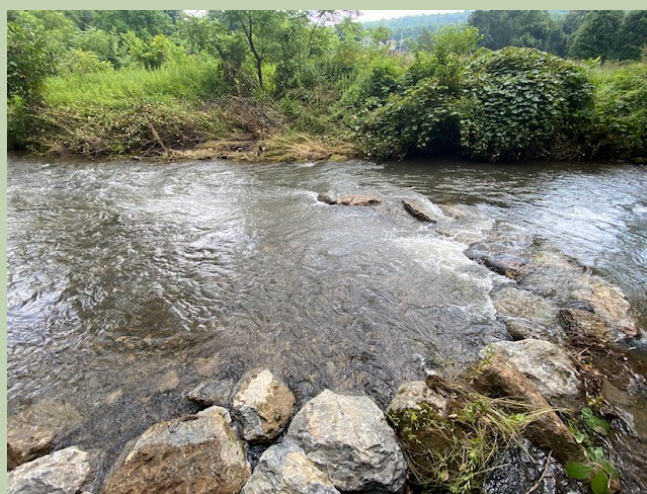
(Above left. A stone J-hook narrows the channel increasing the flow rate and sending the current to a newly installed log diverter. Right. Random boulder placements found upstream of the access road.