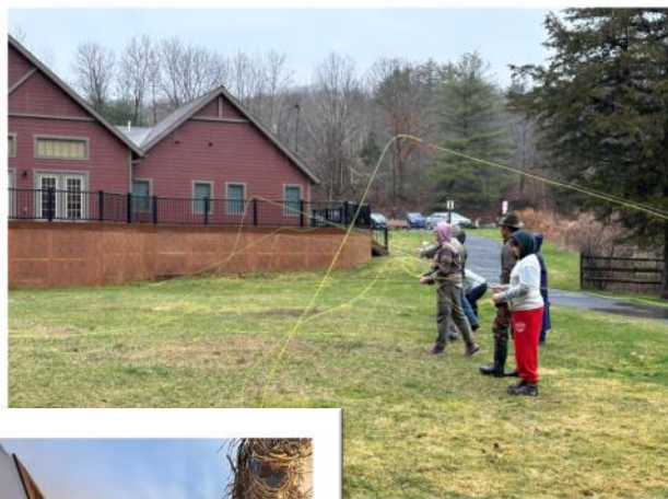
Participants learning to fly cast at the recent fly fishing workshop.