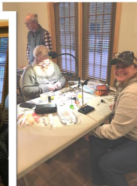
Tyers were busy at the March Brodhead Fly Tyers session.