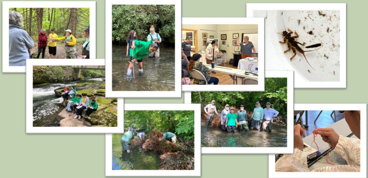
Photo Scrapbook 2004 cont'd.